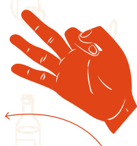
IF I CATCH YOU! (SE TI PRENDO!)