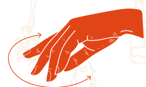
LET'S GO (ANDIAMO)