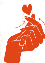
I LOVE YOU (TI VOGLIO BENE)