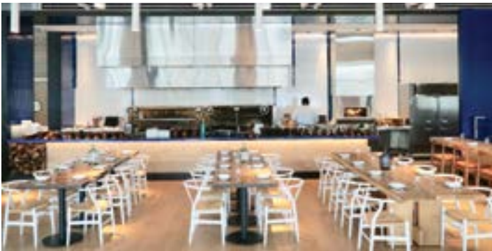
Main Dining Room

Offering direct views of the exposition kitchen the communal table is situated in the heart of the main dining room. Seated: 12