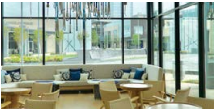
The Salon Room

Our Private Dining Room provides the ultimate intimate setting. Enclosed by a library of Mediterranean wines, this semi-private dining room features curtains, sliding doors, and a dramatic ceiling decorated with hand painted plates. It can be split in half to create two semi-private spaces. Full-Seated: 34, Standing: 30. Half-Seated 12, Standing: 12