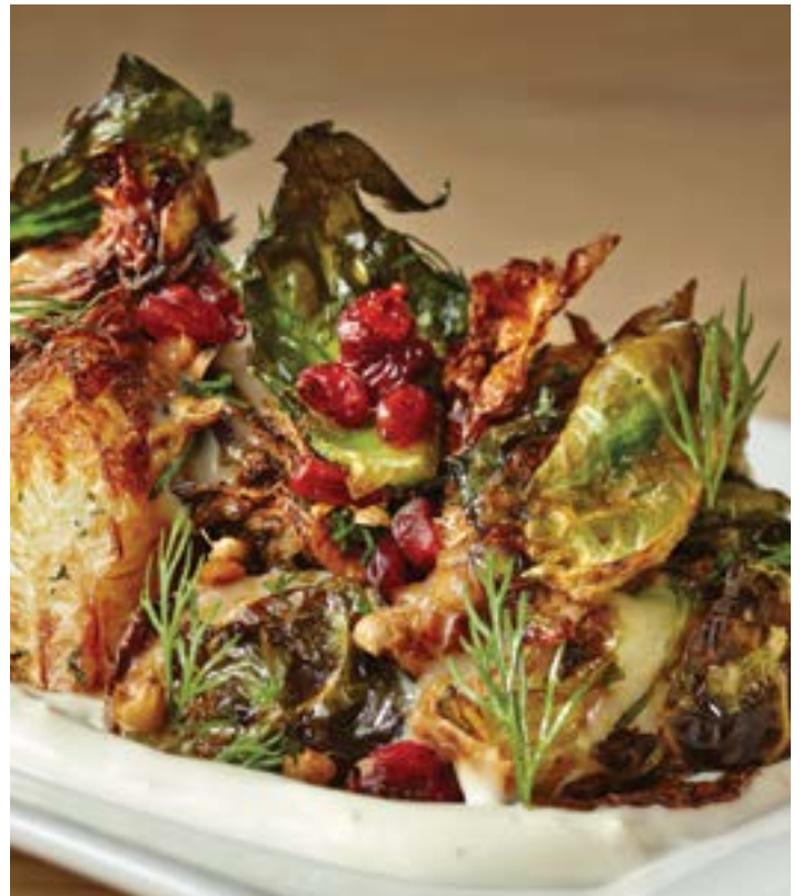
Crispy Brussels Afelia