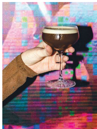
Clockwise from top: Rosé & Rye offers unique cocktail presentations; the bar offers Atlanta's favorite libations; interiors of the rooftop bar.